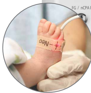
MASIMO Set USB ® can be plugged into the back of the fabians.

PRICO not only supports caregivers in their daily goal for best possible patient comfort and safety, but also helps clinicians save time, reduce cost, and improve their workflow.