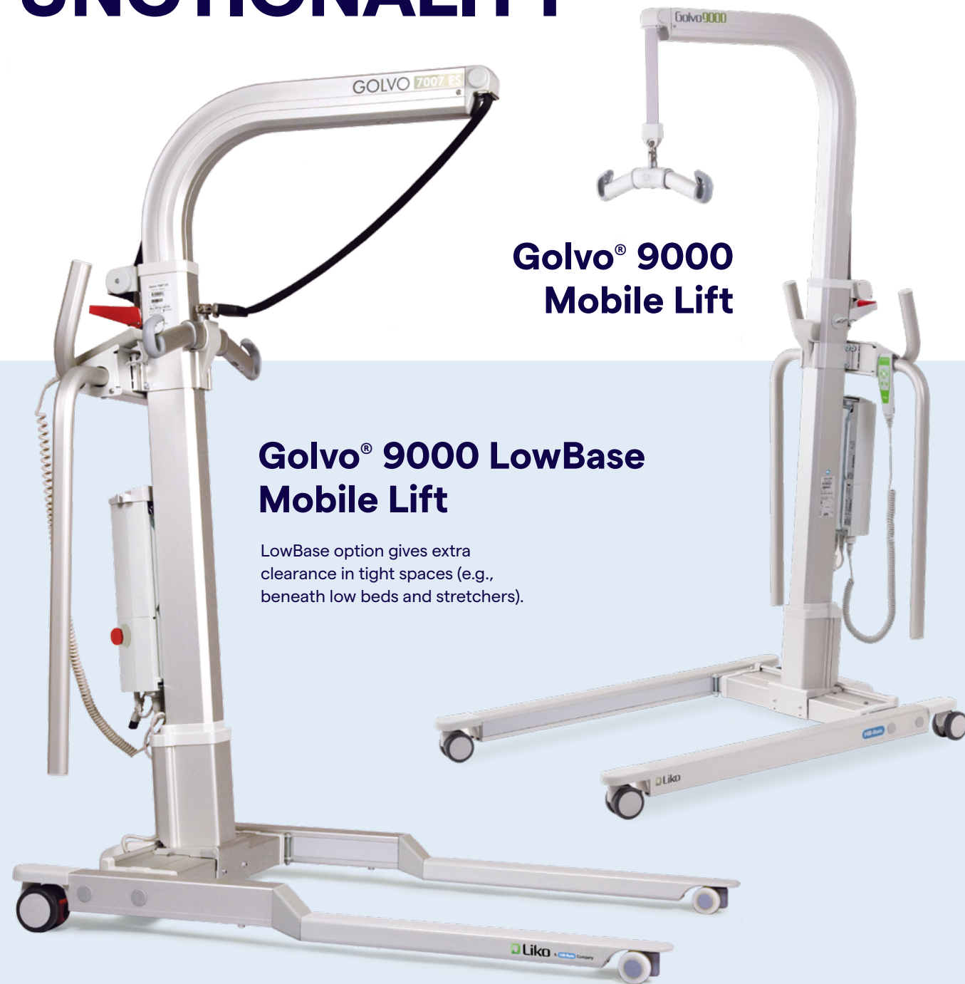
Golvo® 9000 Mobile Lift